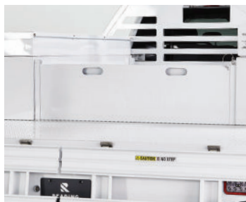
Tailboard position 1

Customize your cargo space with a movable tailboard that can create one large storage area or two smaller ones.